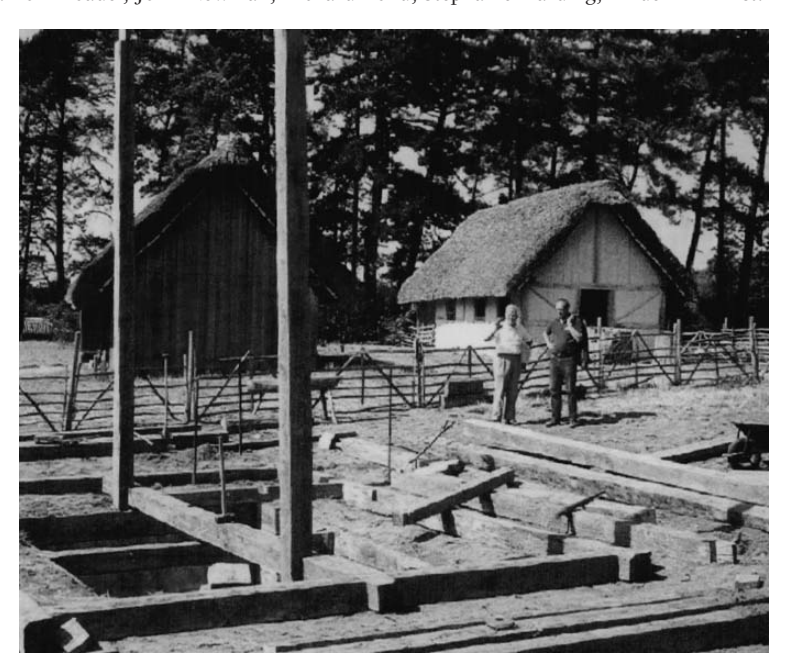
FIG. 168 - Stanley West and Alan Armer at West Stow. Early stages of reconstruction of SFB12, 1992.